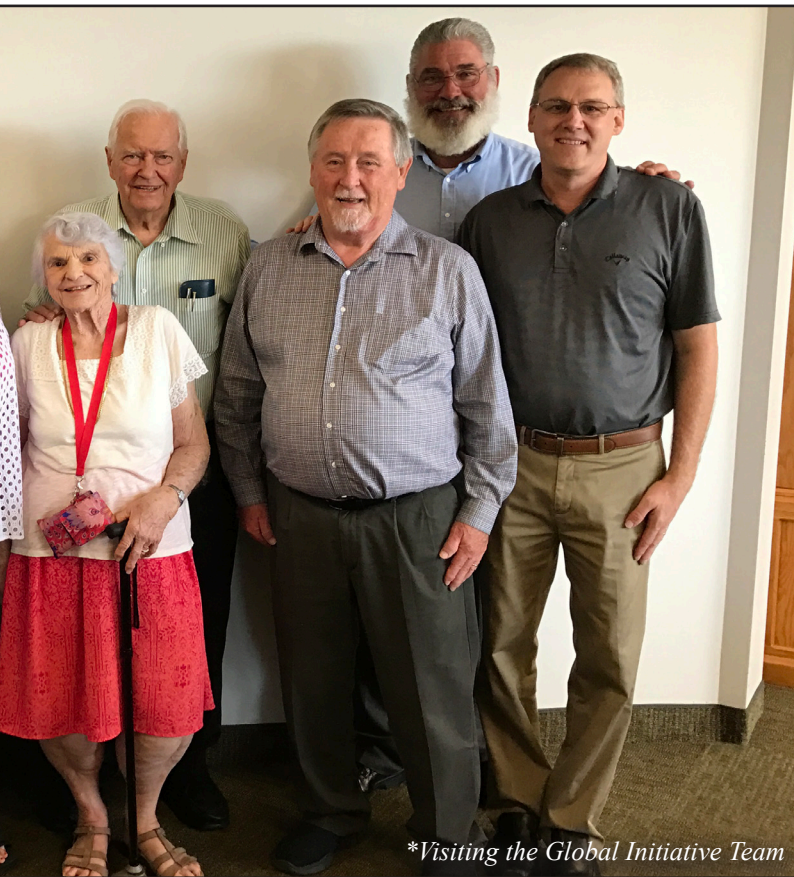
*Visiting the Global Initiative Team